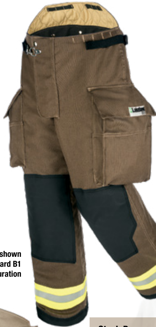
Style BA3307K98 shown right in Standard B1 Material Configuration