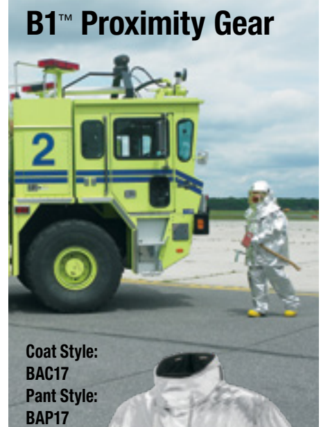
Coat Style: BAC17 Pant Style: BAP17